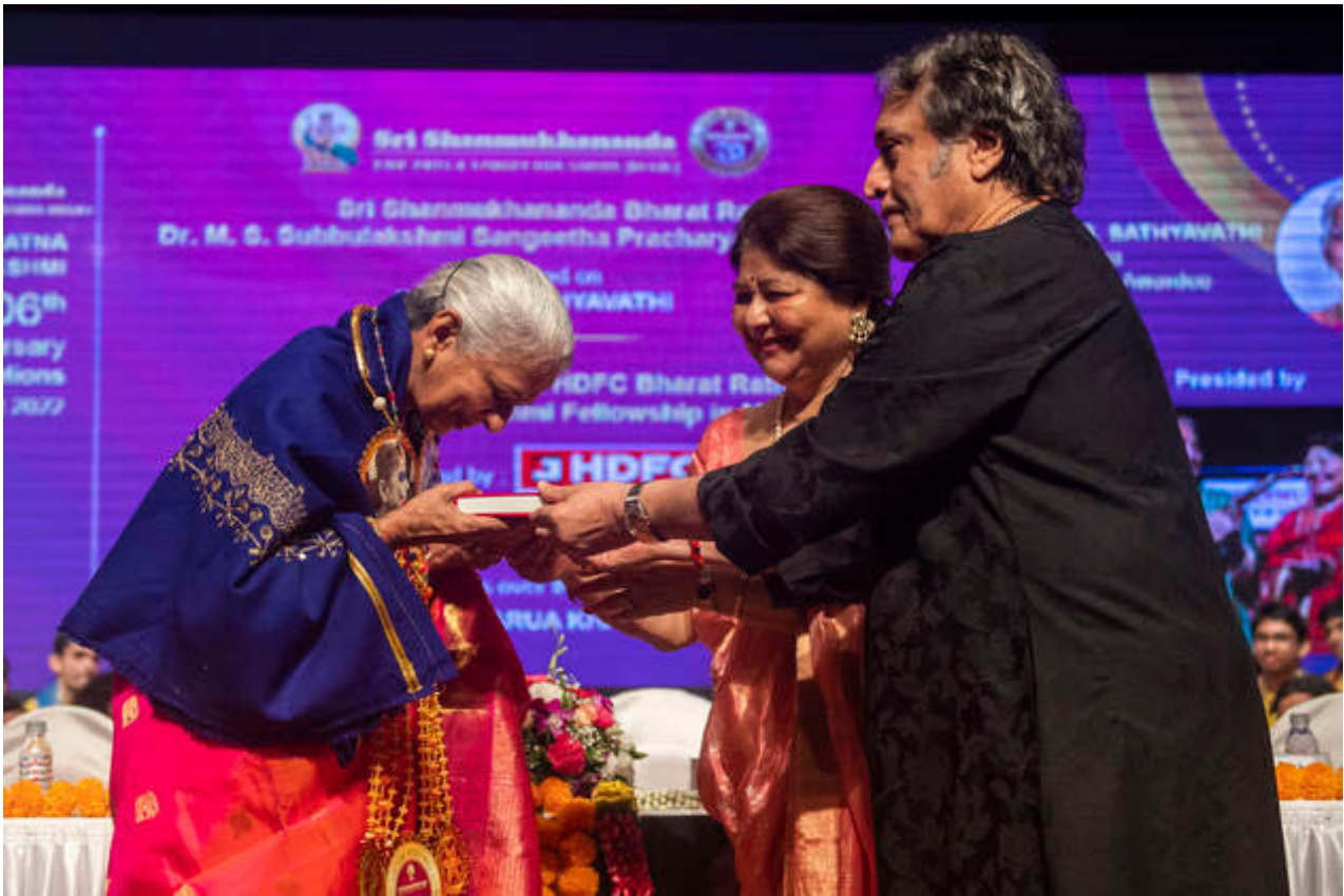
"Sangeetha Pracharya Award" Shanmukhananda Sabha, Ustad Amjad Ali Khan