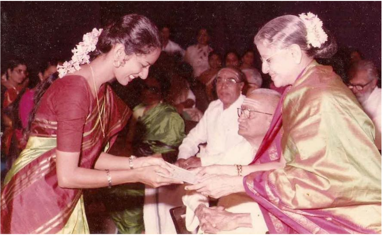
M S Subbulakshmi