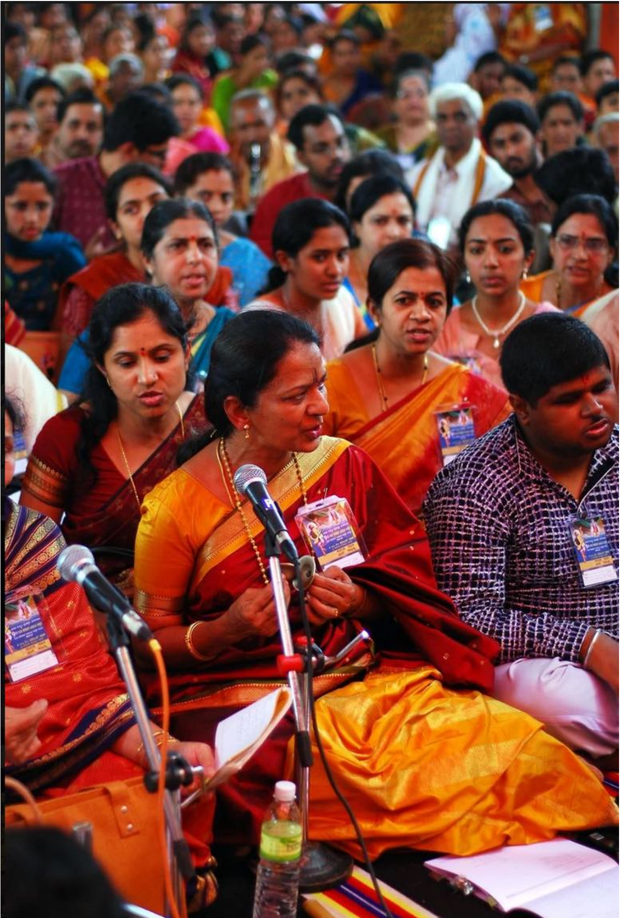
Kanakadasa Jayanti - Kaginele, Haveri, Karnataka