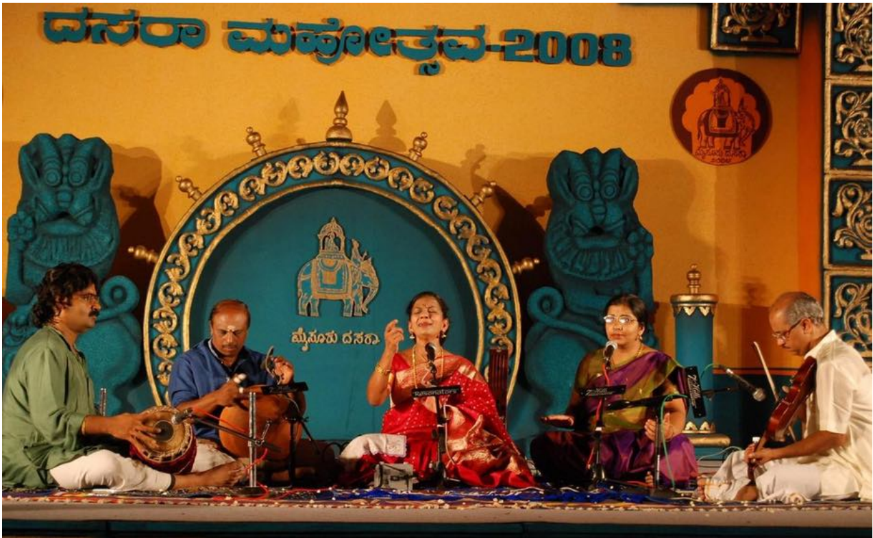
Performances - Mysore Dasara, Sri Krishnadevaraya 500th yr Anniversary