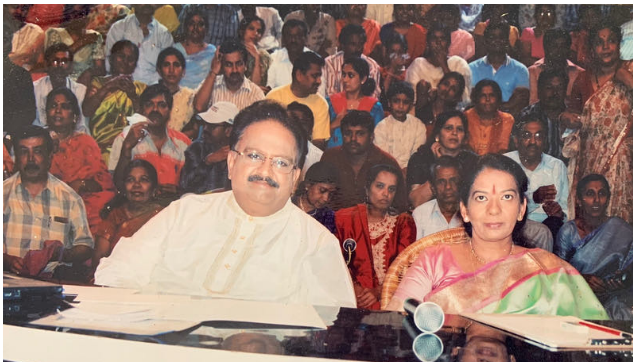
Yede Tumbi Haduvenu, S P Balasubramanyam