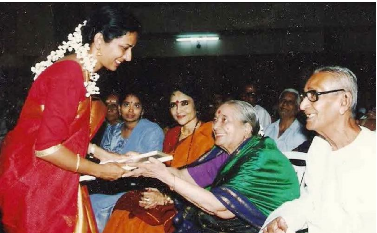
D K Pattammal