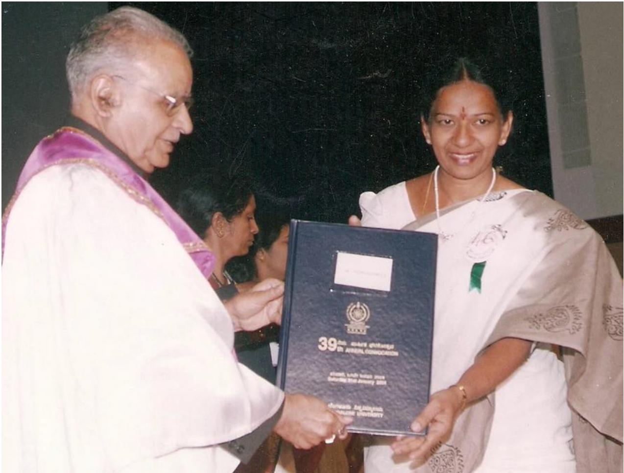
T N Chaturvedi, Governor of Karnataka - Doctrate (Ph.D)