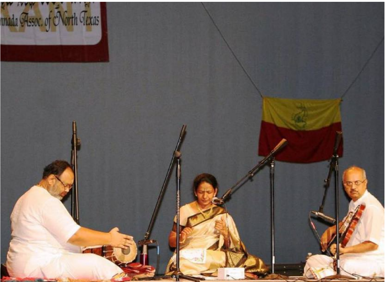
Mallige Kannada Sangha, Texas, USA